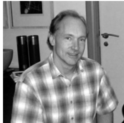
Tim Berners-Lee on 18 November 2005